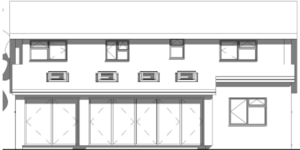
North Elevations Proposed